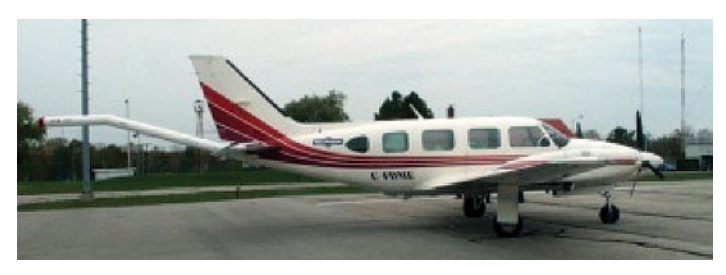
PIPER PA-31 NAVAJO AIRCRAFT in ISMAP configuration.

The benefits of ISMAP are realized by the most modern instrumentation, and the state-of-the-art data acquisition and processing techniques we use, which includes 3-D drape flying, tie-line leveling, micro-leveling, equivalent source corrections where appropriate, and signal enhancement filtering. Aircraft manoeuver noise during an ISMAP survey, of necessity, is very small. Using the "Figure-of-Merit" (FOM) technique to measure manoeuver noise, all our aircraft are typically less than 1.0 nT. In addition, the use of differential GPS for navigation and positioning allows micro-magnetic anomalies to be determined to a positional accuracy of about +/- 1 meter.